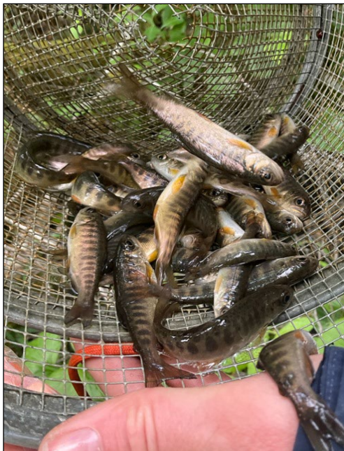
Figure 1.—Juvenile coho salmon caught at waypoint 593.