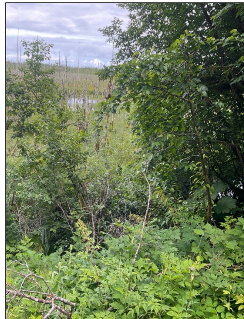
Figure 2.—Ponded water complex at waypoint 593.